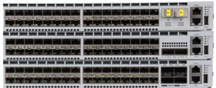
Arista 7280E Flexible Port Combinations

7280SE-64: 4 QSFP+ ports for 4x 40G or 16x10G