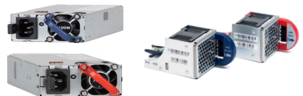
Hot swap and reversible power supply and fan modules