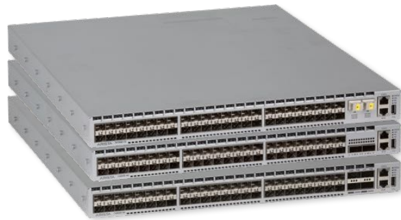
Arista 7280E family

All models in the 7280E Series deliver rich layer 2 and layer 3 features with wire speed performance up to 1.44 Terabits per second. The Arista 7280E Series offer a virtual output queue architecture combined with an ultra-deep 9GB of packet buffers that eliminates head of line blocking and allows for lossless forwarding under sustained congestion and the most demanding application loads. Combined with Arista EOS the 7280E Series delivers advanced features for HPC, big data, content delivery, cloud and virtualized environments.